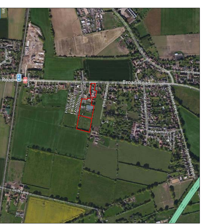
Google Earth Plan